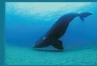
Whales & dolphins